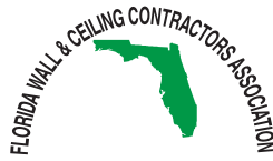
EXHIBIT RULES + CONDITIONS

SPACE ASSIGNMENTS: Every effort will be made by the Association to assign the exhibitor's first choice of space. However, because two or more exhibitors may request the same area, each must specify first, second, and third choices. The Association reserves the right to relocate booth assignments, if necessary, in order to develop a well-knit show or to meet any requirements of the Fire Marshal.